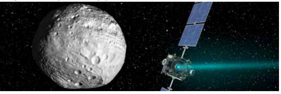
This image of NASA's Dawn spacecraft and the giant asteroid Vesta is an artist's concept. Dawn arrived at Vesta on July 15, 2011 PDT (July 16, 2011 EDT) and is set to depart on Sept. 4, 2012 PDT (Sept. 5, 2012 EDT).

http://www.nasa.gov/mission_pages/dawn/news/dawn20120830.html •